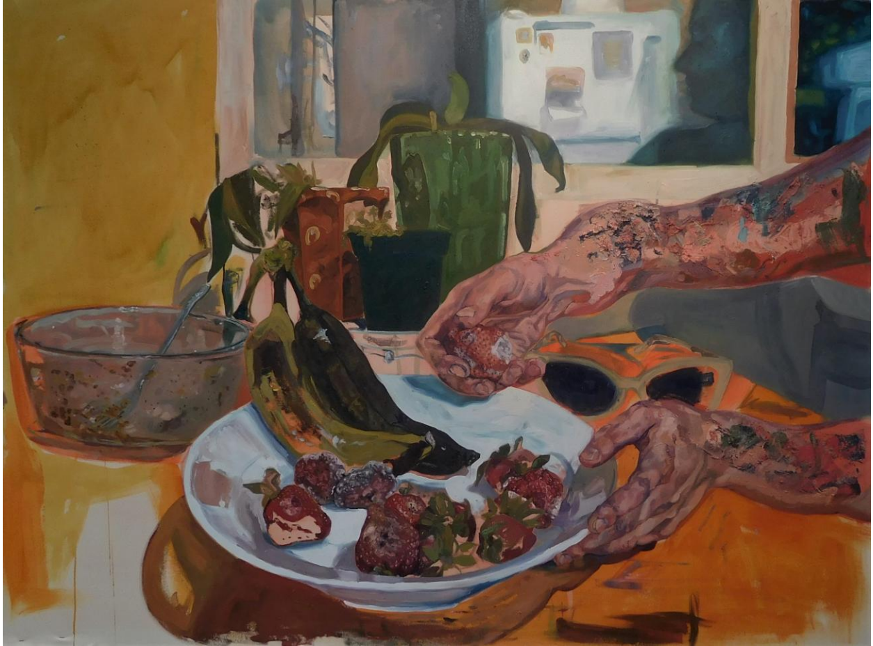
Skin , Oil on Canvas, 2017

The text from Kristeva on food abjection continues as follows: