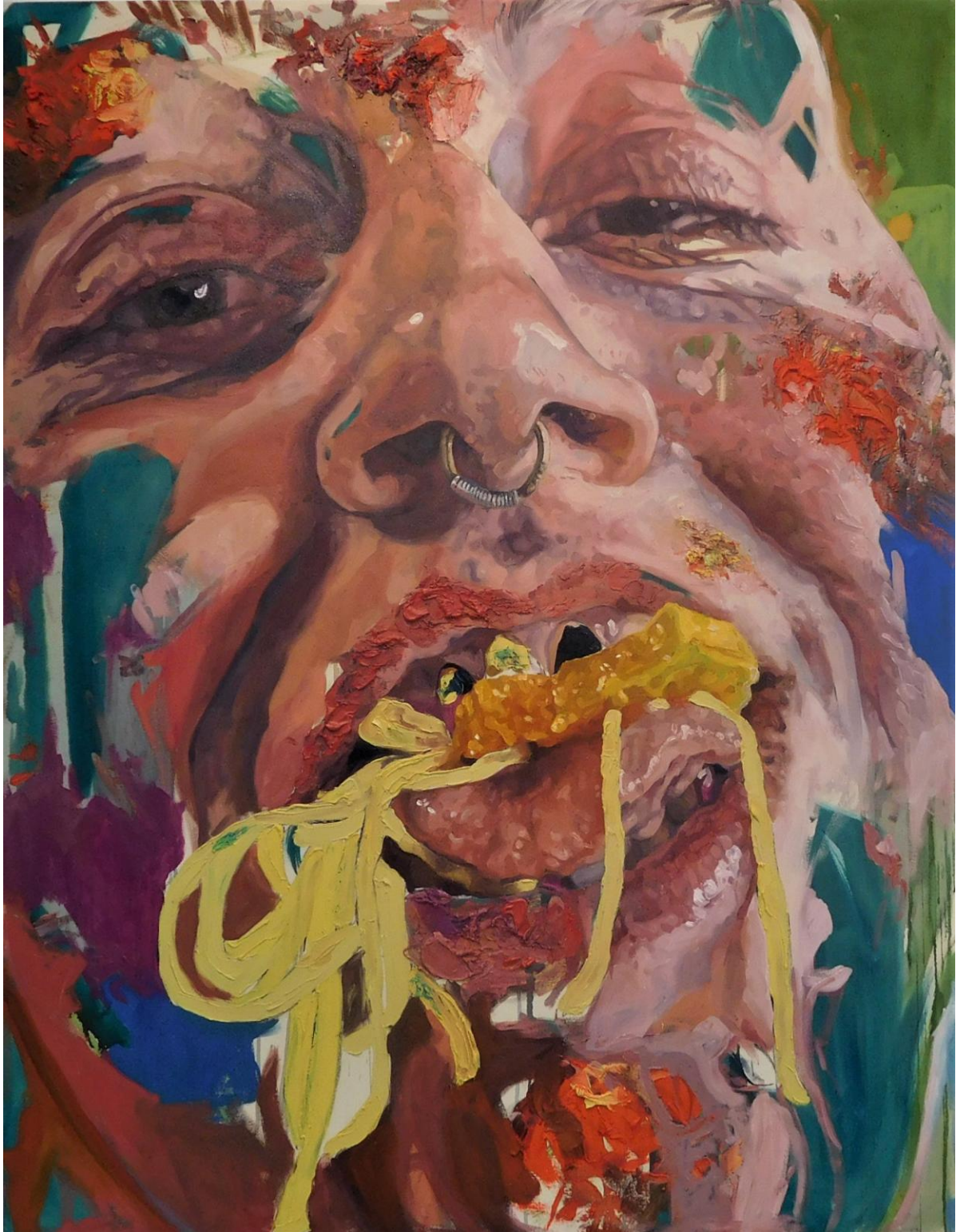
Bite , Oil on Canvas, 2017

The paintings depicting close ups of my face, twisted and manipulated, I think are perhaps the most confrontational, and the most vulnerable. Here, the textured deconstructions and areas of