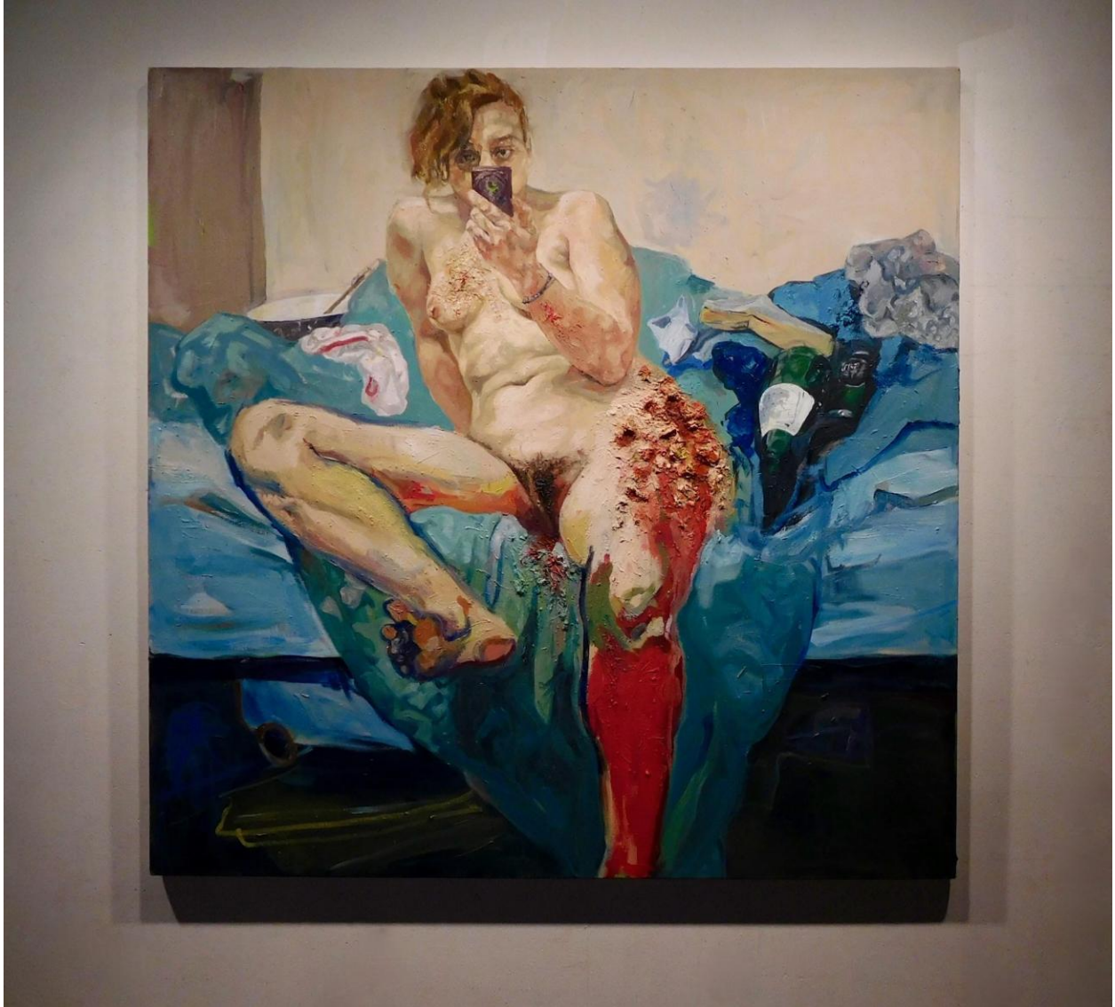
Selfie #1 (2016), Oil on Canvas