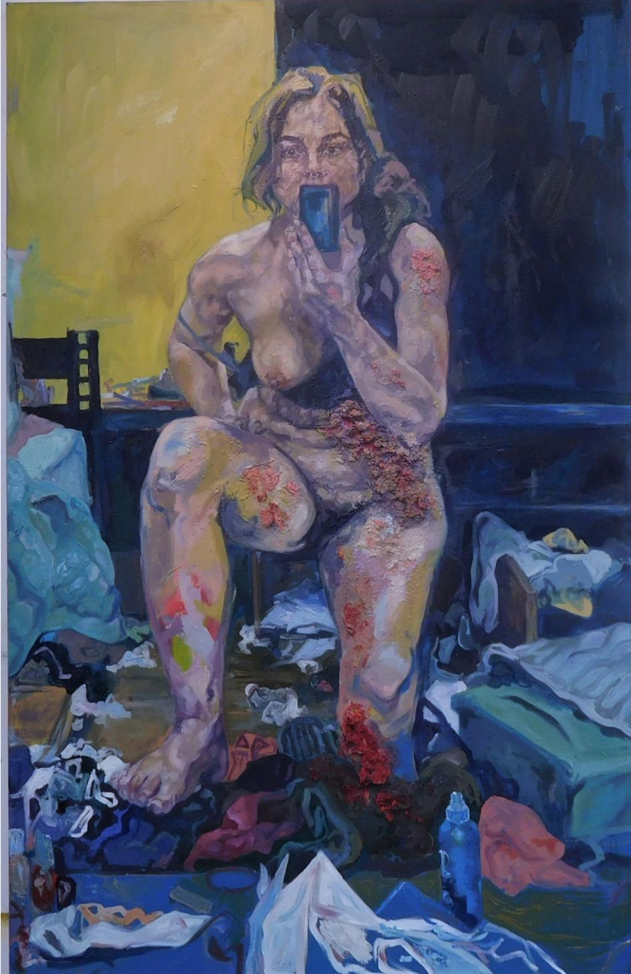
Selfie #2 (2016), Oil on Canvas

Tracy Emin's practice frequently deals with this type of subversive juxtaposition, using her prestige as an acclaimed international artist (a recipient of the Turner Prize, her work has been shown in the Tate Modern and prestigious galleries worldwide) as a platform to infiltrate the upper classes with the most 'vulgar' aspects of her personal life. In her essay "Emin is