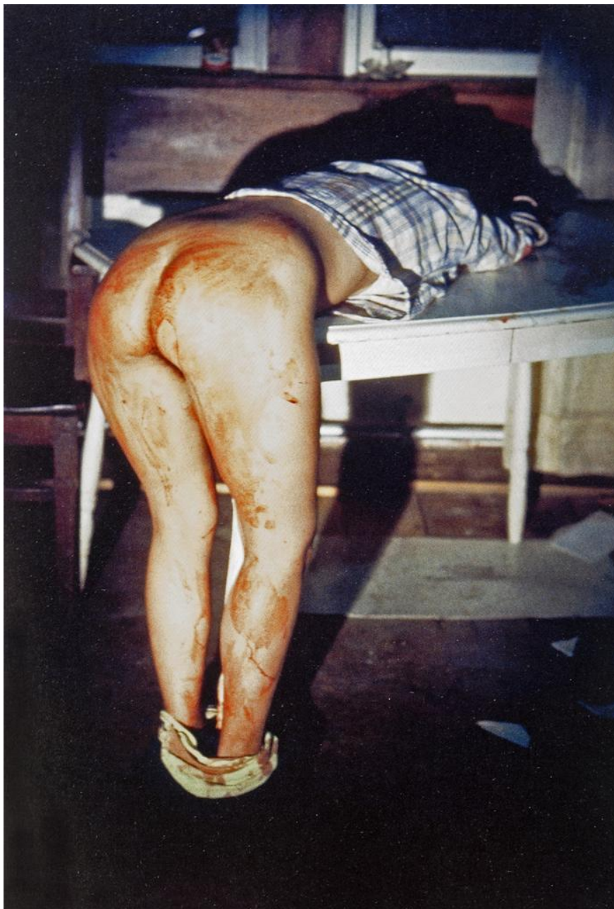
Fig. 4 39