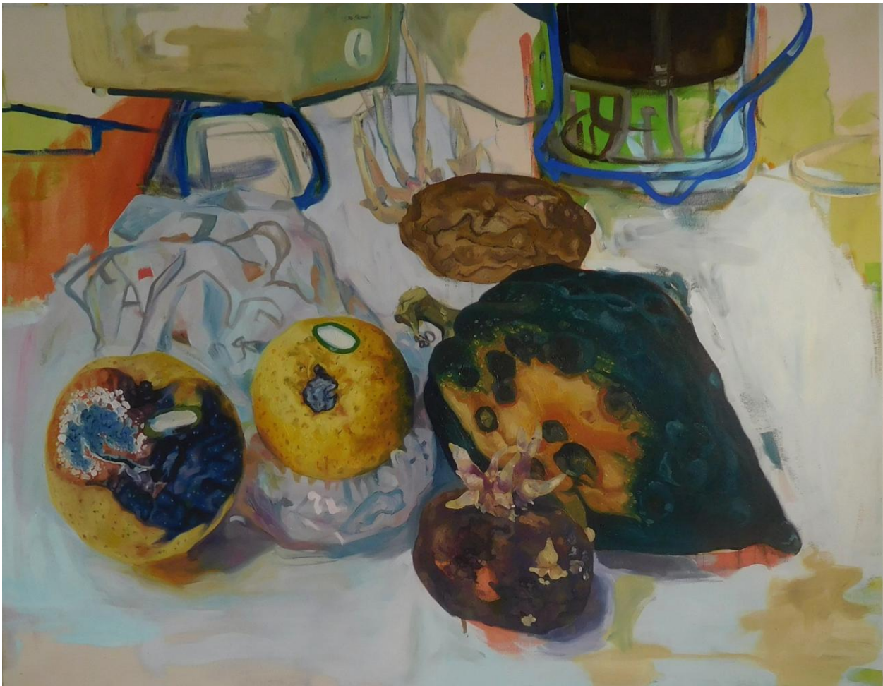
Devour , Oil on Canvas, 2017

implied. This transference between works is also pertinent in and of itself, as it highlights ideas of pollution and contagion which are central to discussions of the abject. The food tableaux recall the tradition of European still life painting, where the brevity of immaculate, fresh food and flowers were meant to serve as a sort of memento mori - pointing again to themes of mortality and decay. The nudes and spoiled fruit form between them a sort of medieval 'Death and the Maiden' motif, which ties in well with Kristeva's theory of abjection - as will become clear below.