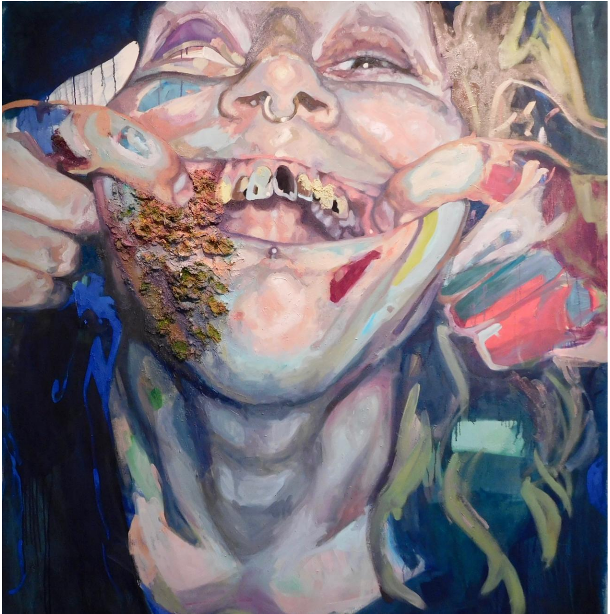
Inside , Oil on Canvas, 2017