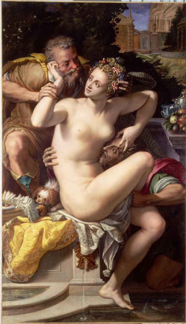
Fig. 1 7

In the contemporary narrative, a woman is told that her beauty is her most valuable commodity, then mocked for using available platforms to display her successful gender performance.