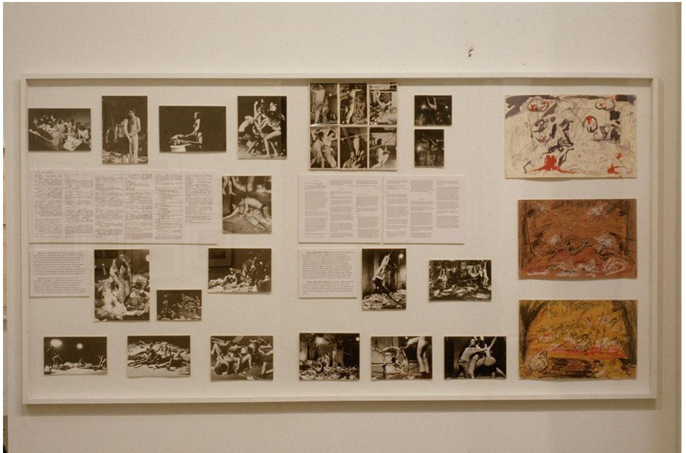
Fig. 5 40

There is something intriguing but also rather pessimistic about the abject being used to destroy the objectifying. The concept seems to necessitate an unmaking of the self, a destructive, entropic process - for if I am deconstructing the gendered self, a self that is a part of me, I am certainly deconstructing myself in the process. What is the alternative? Only continued obedience to a repressive symbolic?