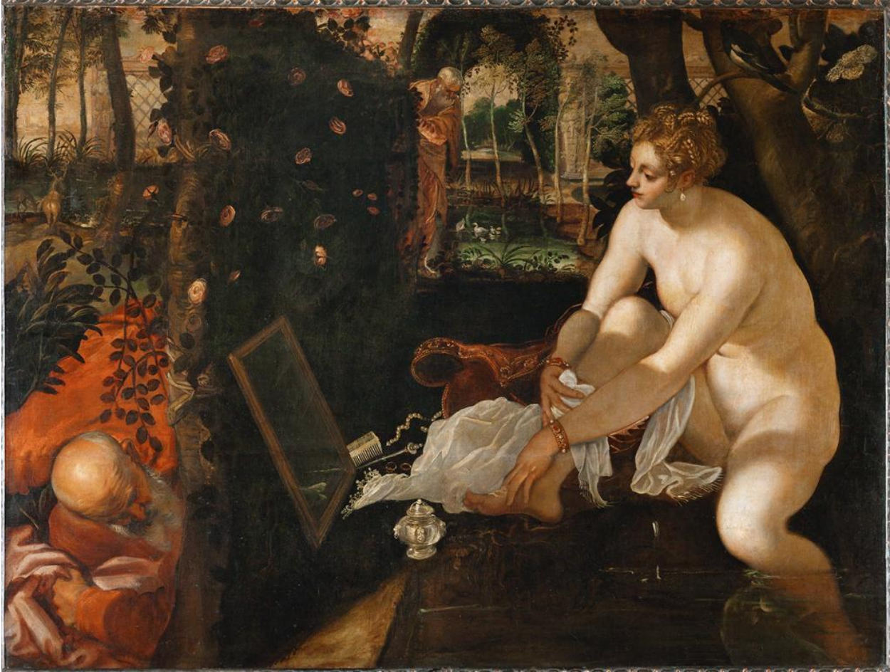
Fig. 2 8

There is an element of blame attached as well; as Berger implies, the alleged vanity of women becomes a vehicle for deferring a man's culpability. This is borne out in one of my favorite allegorical subjects, the apocryphal story of Susanna and the Elders. It was particularly popular with the baroque painters; Rubens, Rembrandt, Tintoretto and Alessandro Allori (along with many others) all tackled it, sometimes more than once. The parable tells of two wicked village elders who spy on a chaste Jewish wife at her bath, then confront her and try to seduce her. When she refuses, they tell the town that she slept with them, a 'crime' which nearly results in her being executed, until a holy man notices inconsistencies in the men's stories and pronounces her innocent. The most popularly depicted scene is of course the moment of spying, which I feel quite neatly illustrates the politics of looking typical of the allegorical nude genre. As in