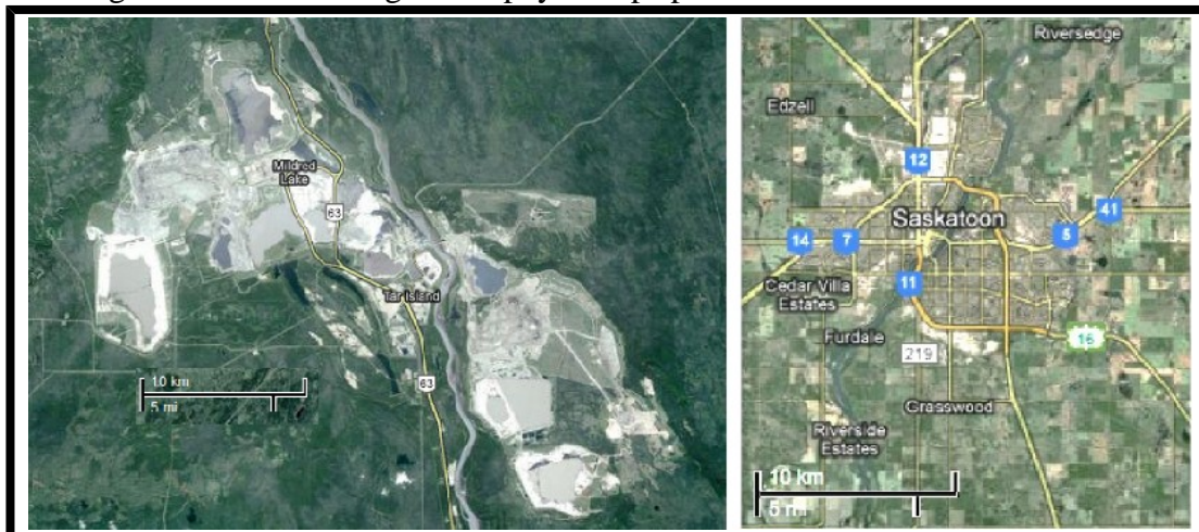
Figure 1. A single oil sand mining site can be much larger than Saskatoon. Left : an aerial view of a single company's mine site. Right : the city of Saskatoon at a similar scale.

Over time, some weedy pioneer plants colonize tailing sand. Plants growing in harsh environments have been shown to contain endophytic fungi that allow them to survive (3). Using this knowledge we isolated a fungal endophyte helps plants thrive on TS without fertilizer.