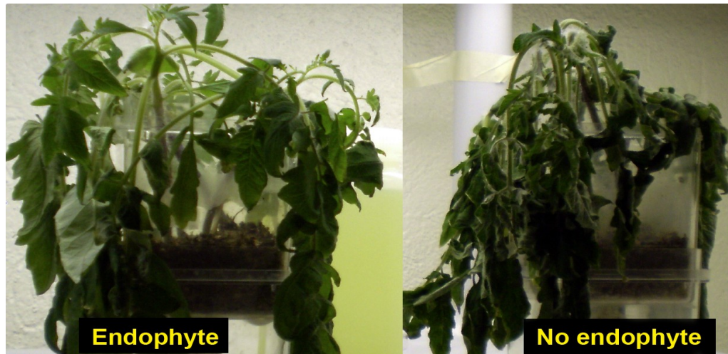
Figure 3. TSTh20-1 leads to increased drought tolerance and recovery. On the left are plants grown without TSTh20-1 and on the right are plants grown with the endophyte.

Four native Prairie plants were selected from 22 commercially-available species for their seeds' ability to germinate on well-watered TS. These are: Bouteloua gracilis (Blue Grama), Elymus trachycaulus (Slender Wheat Grass), Trifolium repens (White Clover), and Medicago sativa (Alfalfa).