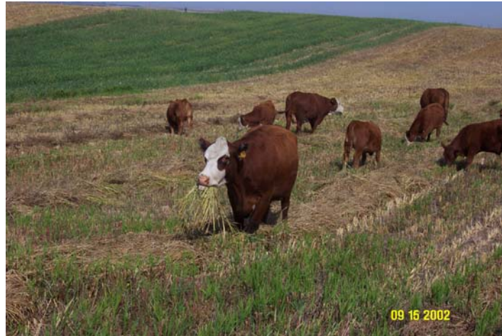
Figure 1. Beef cattle grazing foxtail millet in 2002.