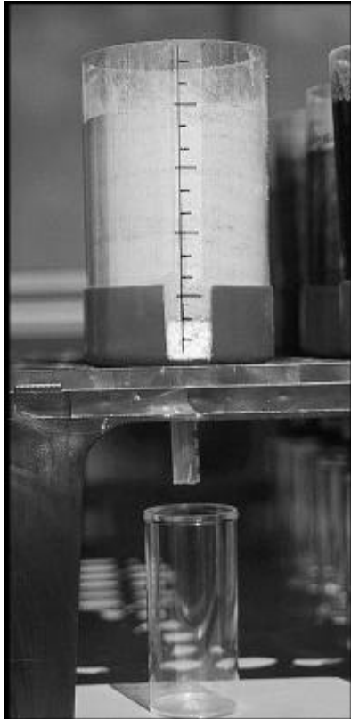
Figure 1. Column apparatus used in the copper mobility experiment.

† Note: Bulk densities used to pack columns with dry soil.