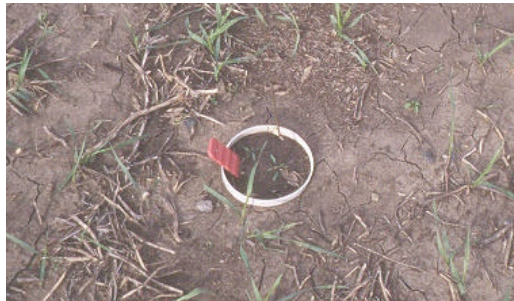
Figure 2. Root exclusion cylinder consisting of a PVC pipe inserted to a 10” depth from which plants were removed to isolate the PRS™-probe from plant root competition.

Plant roots can also compete with the PRS™ for ions. In studies extending over days or weeks, burying the PRS™ near plant roots results in a measure of the difference between net mineralization and plant uptake (nutrient surpluses rather than net mineralization). Net mineralization without root competition can be assessed by inserting a “root exclusion cylinder” (Figure 2) into the ground, removing plants, and burying the PRS™ within the soil area isolated by the cylinder. By burying PRS™ both inside and outside of the cylinders, a more complete picture of the soil NO 3 -N dynamics can be obtained. The impact of plant root competition on soil nutrient supplies measured over a growing season is shown in Table 6.