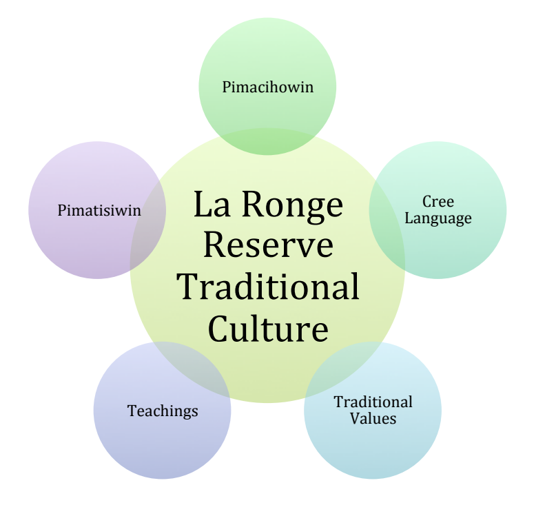
FIGURE 4-3 Themes of Traditional Culture