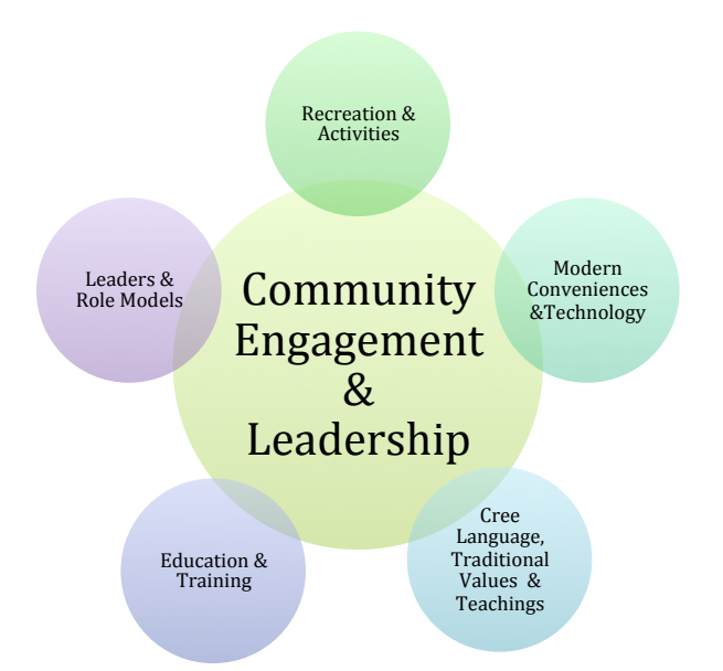
FIGURE 4-1 Themes of Community Engagement and Leadership

be addressed in order to achieve a healthy community. Therefore, in order to address challenges due to Western influences and the shift away from traditional ways of life, participants identified solutions and their vision of what a healthy and economically successful community is. The main themes that came out from the first part of the survey questionnaire concerning community engagement and leadership include: leaders and role models, education and training, elder's teachings, community activities, and influences of modern conveniences and technology on contemporary community life (See Figure 4-1).