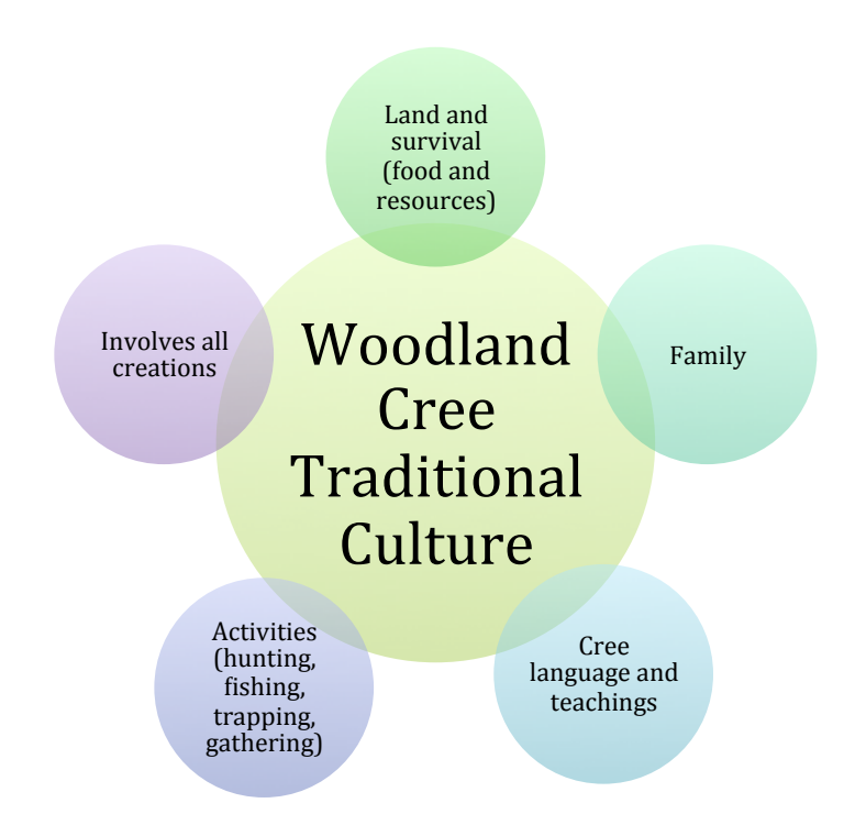
FIGURE 4-4 Elements of Woodland Cree Traditional Culture

unchanged, but cultural transmission from older to younger generations must continue or these principles, values and customs will be lost in time.