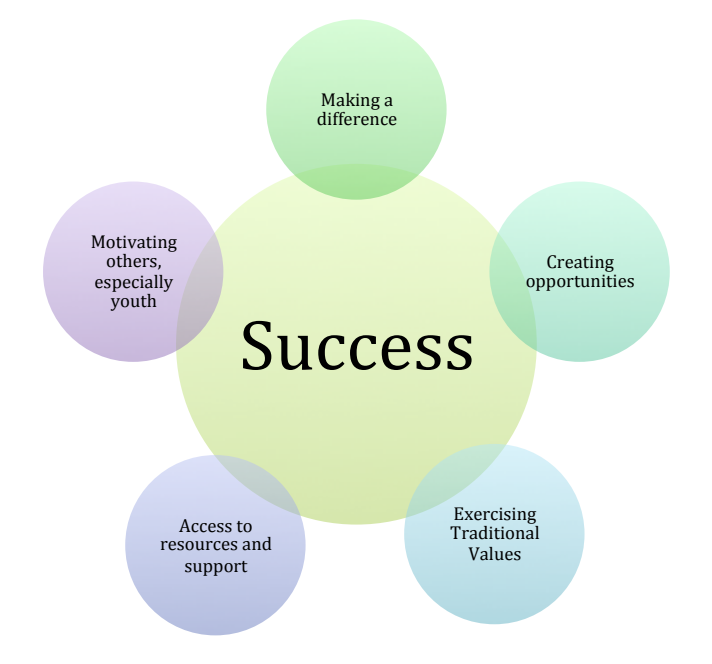
FIGURE 4-2 Determinants of Success

Overall, success cannot be simply defined, and there were many core themes that came from the participants' responses when they were asked to define success (See Figure 4-2). Success to the community means having each individual making an effort to help within the community and make a difference, whether it is through supporting, motivating, and/or guiding community members, especially youth. Success is having opportunities available for education, training, employment, and entrepreneurship, and ensuring that all community members have an awareness of and access to information about these opportunities. Success is also having opportunities available for community members to be involved in cultural, recreational and sporting activities and events that promote healthy lifestyles, teamwork, and skills training.