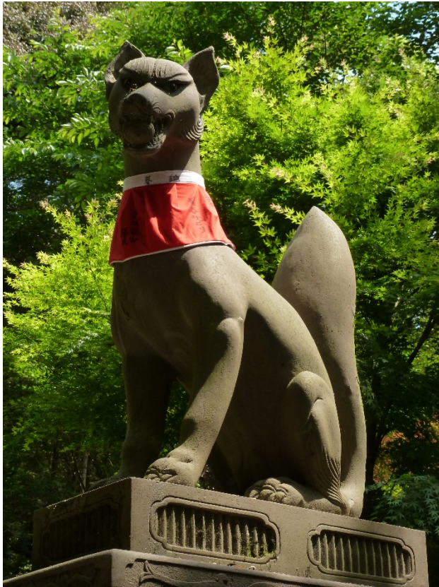
Figure 1.1 Fox statue at Fushimi Inari Taisha

kitsune zō 狐像 or “fox statues.” These statues are often found in abundance at Shintō shrines and Buddhist temples which enshrine Inari. 36