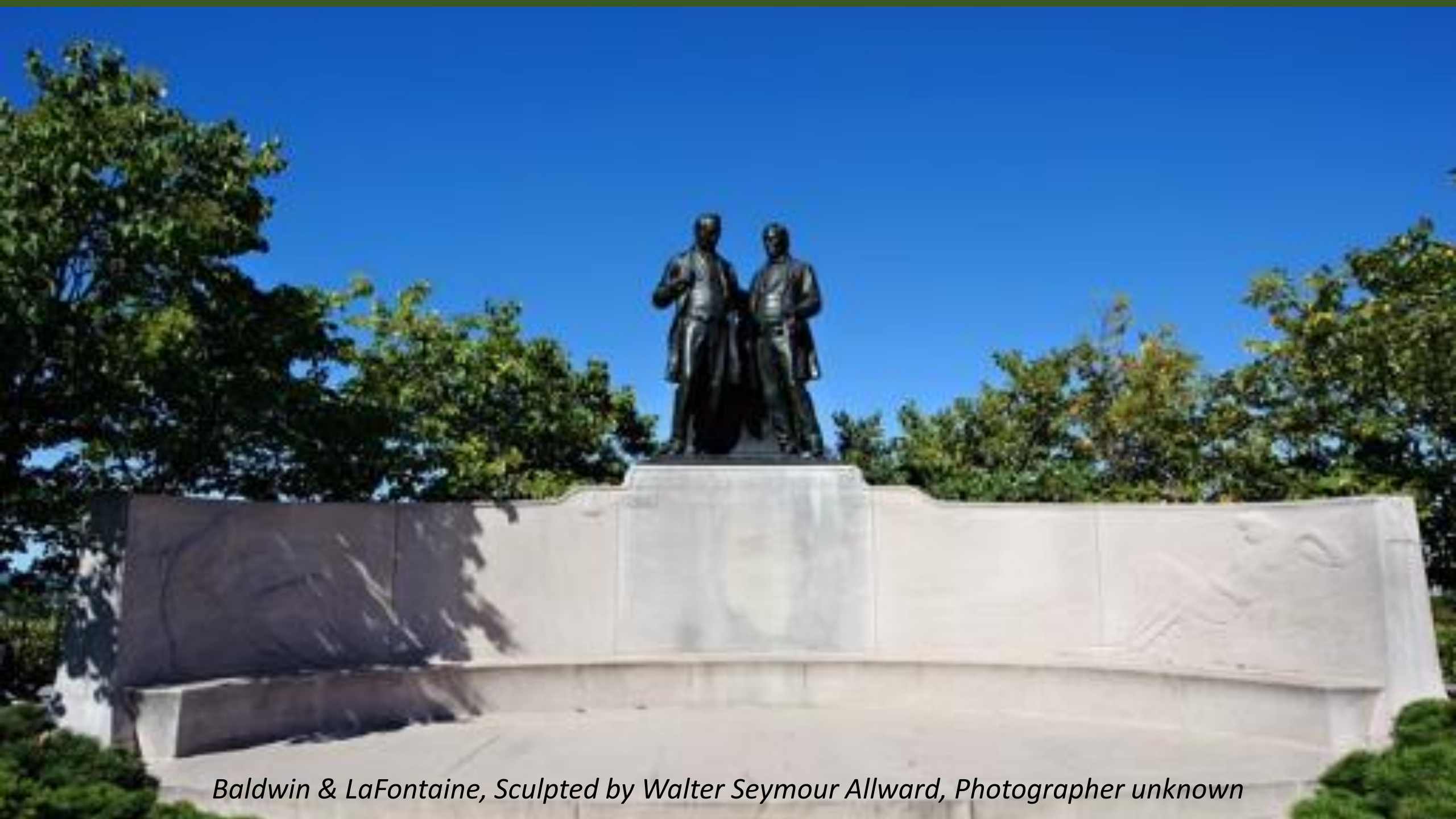
Baldwin & LaFontaine, Sculpted by Walter Seymour Allward