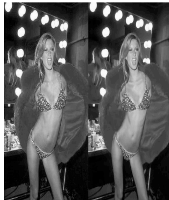
Image 2: Original photograph on the left; Photoshopped image on the right.