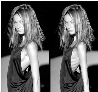
Image 1: Original photograph on the left; Photoshopped image on the right.

Pro-ana members use images of other women whose bodies they desire to increase their ability to control their own bodies. Commonly referred to as thinspiration (pictures of extremely thin or emaciated individuals), these images act as a means of inspiration and motivation for individuals to maintain their goals. The images showcased within the websites often depict young women in various states of undress. Typically, the bodies of the featured young women are extremely thin, sometimes to the point of protruding bones. Due to the fact that pro-ana members believe that bones are attractive, photos in some cases are edited with Photoshop to create the impression that the individuals are extremely thin. An example of this editing is provided in photos 1 & 2, where I contrast the real images on the left with the Photoshopped image on the right.