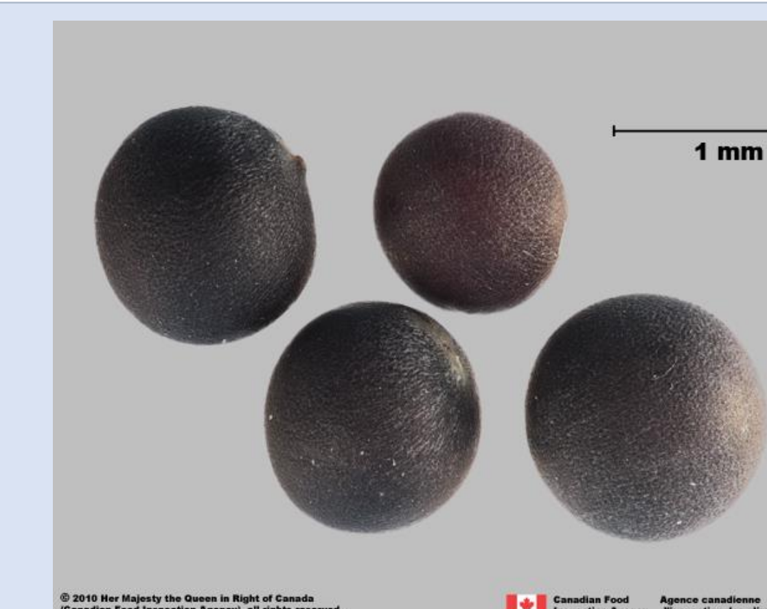
Fig. 1 Wild mustard ( Sinapis arvensis L.) seeds