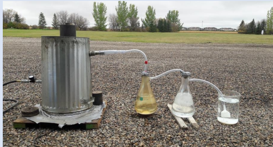
Fig. 2 Smoke-water producing setup (Kernan Farm) where smoke from smoldering plant passing via distilled water containers