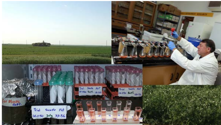
Figure 1: A snapshot of experimental site with lab set-up in inset.

In general, the July values of DHs activity appeared to be higher than those of September. This trend seems to be associated with mean temperatures of those months, July being much warmer (mean temperature ~ 18°C) than September (mean temperature ~ 12°C).