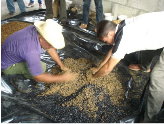
Fig. 1 Manual application of EcoMic® and Azofert® on-farm.