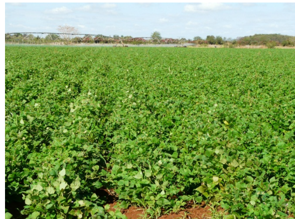
Fig. 4 60-day old bean field inoculated with EcoMic® + Azofert®, and receiving half the recommended rate of NPK plus FitoMas®.