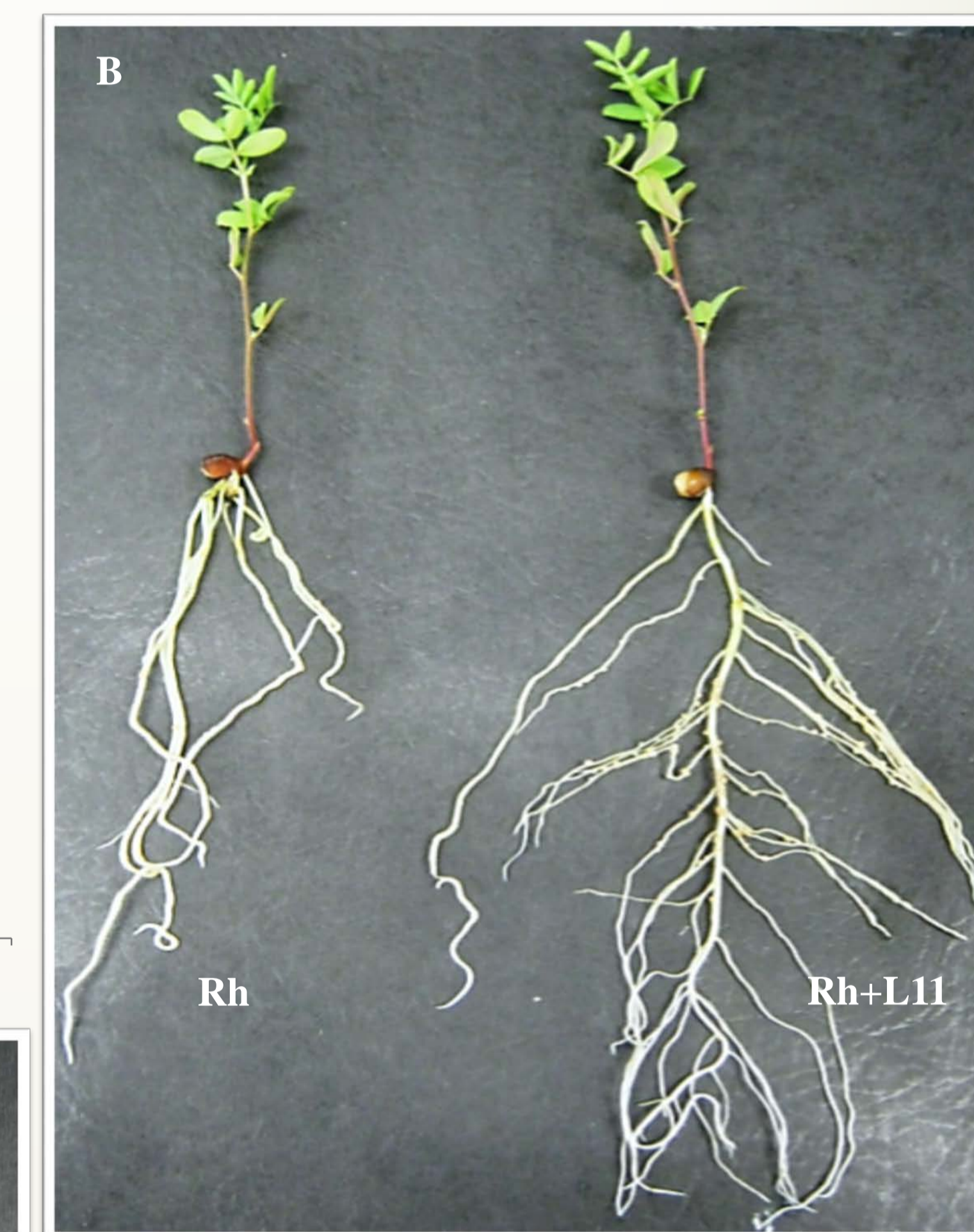
Fig. 4 Effect of the ten H 2 -oxidizing rhizobacterial isolates on the number of root nodules per lentil plant three weeks after inoculation assay in the greenhouse. (A) Bars with the different letters are significantly different at \alpha = 0.05 (Tukey HSD, n = 6 ). (B) Lentil was inoculated with Rhizobium leguminosarum (Rh), and nodulation of the roots of lentil inoculated with (Rh) plus H 2 -oxidizing rhizobacterial isolates. (C) Lentil inoculated with Rhizobium leguminosarum (Rh), and nodulation of the roots of lentil inoculated with (Rh) plus H 2 -oxidizing rhizobacterial isolates (D) L14, (E) L20, and (F) L11.

➤ According to the greenhouse assays, seven H 2 -oxidizing rhizobacterial have potential to promote shoot-root biomass and root nodules number per plant (Fig. 4)