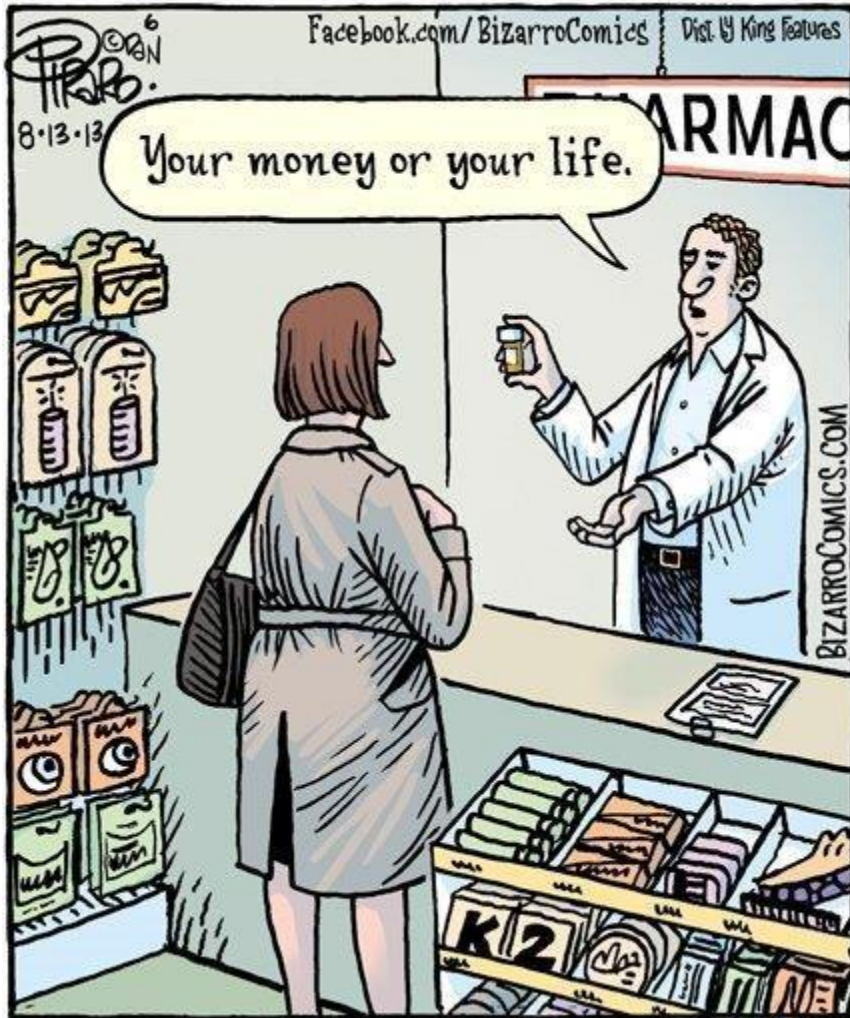
Figure 4-2. Permission from Dan Piraro.

Finally, two participants noted a general trend in monopolization of media outlets as an important factor in limiting Canadian's exposure to multiple viewpoints. They claimed that the simple fact that media is concentrated in fewer hands than it was in the past, would prevent diverse opinions and narrow their focus: