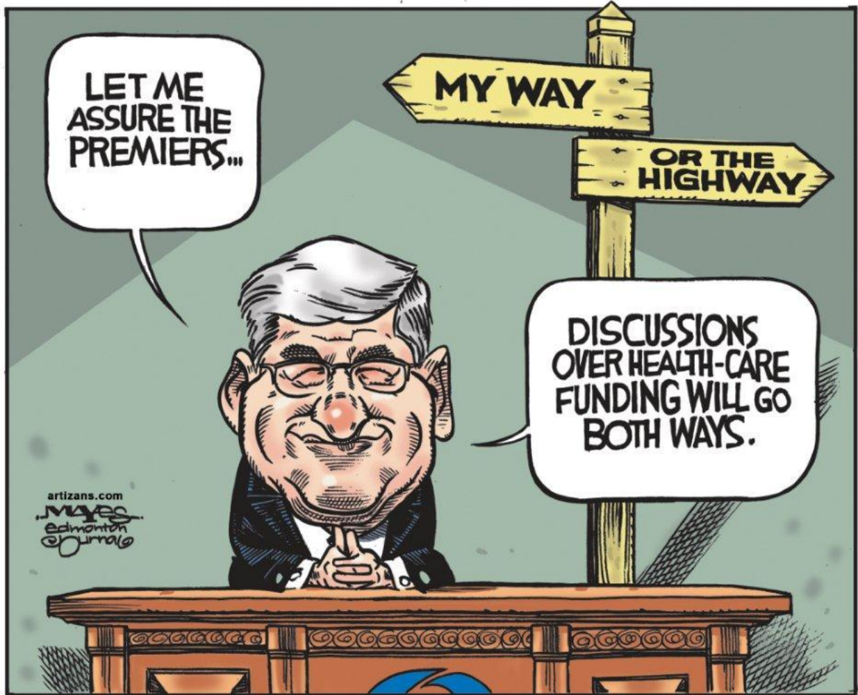
Figure 2.1. Permission from Malcolm Mayes / artizans.com.

Providing a ‘cash-crunch’ argument with a ‘service inadequacy’ problem gives an opening to neoliberal solutions and can also significantly influence policies related to healthcare. Since the early 1990s Canadian governments have focused on deficit and debt reduction and/or elimination (Armstrong, 2000). As a result, there has been a recent flurry of ‘austerity’ budgets, including the Canadian federal and Saskatchewan provincial budgets in 2012. Austerity measures, however, seem to have their greatest impact on the working and middle classes while the wealthy remain virtually untouched; Spain and Greece offer good examples of this in Europe;