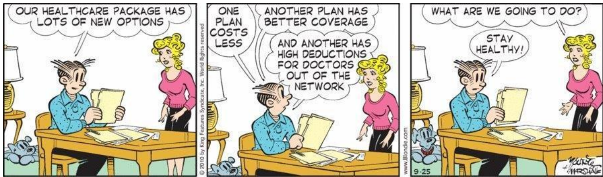
Figure 1.1

For the record, I am a proponent of public healthcare and believe that to preserve Canada's current system we need to understand public perceptions and attitudes. However, I do recognize that our system is far from perfect and could benefit greatly by studying successful healthcare systems in other countries. According to the Conference Board of Canada (2013, April), Japan, Switzerland, and Italy all rated higher than Canada in terms of health performance. The Commonwealth Fund (2010) ranked Canada sixth out of seven countries in overall healthcare system performance, behind the Netherlands, the United Kingdom, Australia, Germany, and New Zealand. According to Tandon, Murray, Lauer, and Evans (2001), Canada ranked 30 th overall for healthcare efficiency compared to other WHO countries. And Snowden, Schnarr, Hussein, and Alessi (2012) stated that Canada's healthcare system has recently lagged behind other OECD countries in areas of life expectancy and infant mortality. In terms of healthcare spending, Canada's position is also less than stellar. Despite a similar governance structure to the United Kingdom and Australia, Canada's health system costs are much higher than either country, and among OECD countries, the cost of pharmaceuticals is superseded only by the United States (Snowdon et al., 2012). And in 2011, only five out of 28 OECD countries spent more per capita on healthcare than Canada (OECD, 2013).