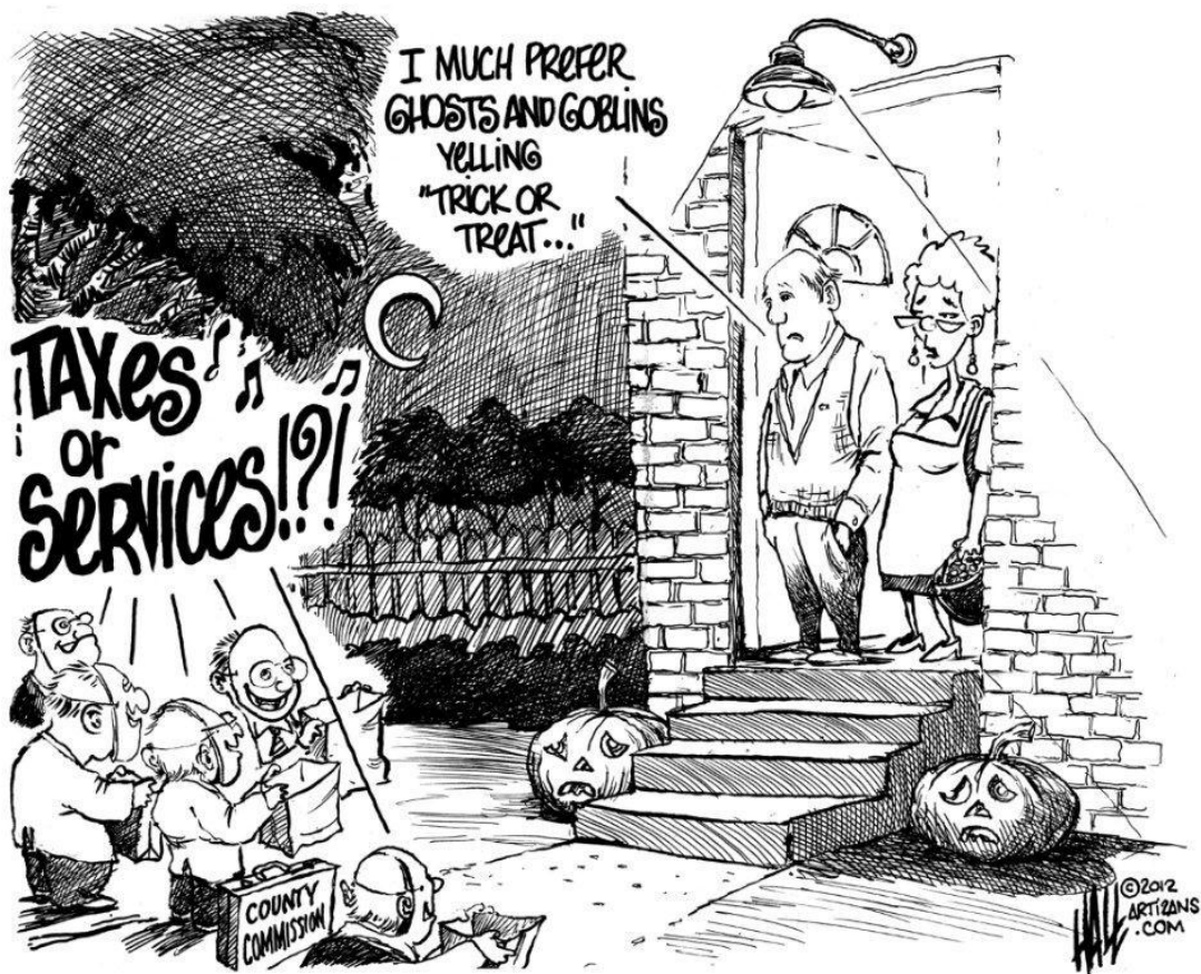
Figure 2.2

debates. Even the focus on individual responsibility for health has an economic component in that neoliberal governments can use it, combined with austerity policies, to cut costs and help solve the problem of escalating expenditures (Pederson, O'Neill, & Rootman, 1994, as cited in Brown, 2010). Occasionally, the neoliberal solution to problems of public policy do not even consider increasing taxes at all; there is but one option and that is an austerity budget with heavy cuts to social program spending. A recent example of this was seen in Ontario Liberal Premier Dalton McGuinty's instructions to the Drummond Commission (McQuaig, 2012; Weir, 2012) that was tasked with finding solutions for Ontario's large deficit (Foster, 2012). The option was not whether or not to cut spending but only where to cut it.