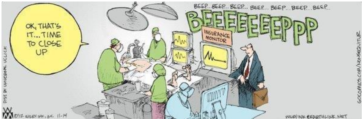
Figure 3.1.

Since there may be a difference between union and non-union members in terms of social democratic attitudes – union members tend to be more left wing on economic issues (Atkinson et al., 2012) - my sample allowed me to better analyze the beliefs of a very specific socioeconomic group. (At the same time I need to be careful with generalizations to all working-class people in Saskatchewan since results from non-union sources may differ). I also chose this sample group as they were likely to be easier to access for requesting interviews. As paradoxical as it sounds, my sampling may be described as a typical, yet unique case type (McMillan & Schumacher, 2010). While my sample group is certainly typical in some respects – working class and Canadian – in other ways, it may offer a unique perspective due to their union status, in addition to Saskatchewan’s unique political history and geographic location. My goal was to interview 10 executives and/or representatives in Saskatchewan unions, and this I was able to achieve. The size of the participant group was chosen because it is a large enough sample to try to find connections and common themes yet small enough to be able to go in-depth in an area which often only receives superficial treatment in quantitative studies.