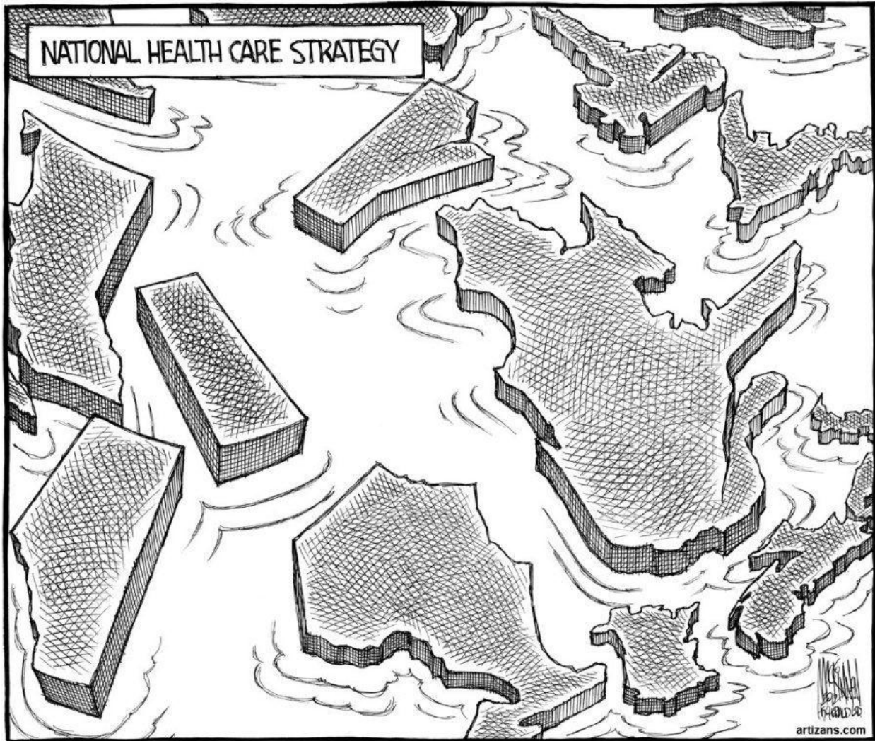
Figure 4-1. Permission from Bruce MacKinnon / artizans.com.