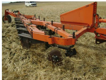
Figure 1. Non-inversion subsoil tillage implement called a Paraplow in operation

Paraplowing is a form of non-inversion subsoiling sought after by producers for its effectiveness at loosening soil structure without compromising the soil conservation practices that are already employed on the farm. Soil structure can be a limitation to crop production in irrigated cropping systems (Grevers and de Jong, 1992). Soil structure has implications on water infiltration, storage, and runoff from the soil surface. Modifying the soil structure by mechanical means can be effective in loosening soil structure. Creating a soil environment with fewer limitations for plant growth. This study aims to evaluate a subsoiling using a Paraplow, a bent leg subsoiler producer by Howard Rotovator. Observing how it modifies the soil structure by looking at soil bulk density, moisture content, and crop response to determine if there economic benefit to subsoiling in Saskatchewan.